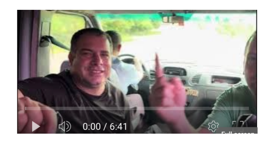
Interview with the Superintendent of the Methodist Church in Cuba