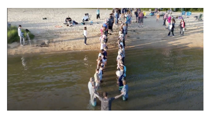
Daybreak's Baptism at Jamestown Beach

the people of Daybreak Church. They are a gifted congregation with a great love for worship and their walk with Christ! One of the recent highlights was the confirmation of 11 youth, which included six baptisms.